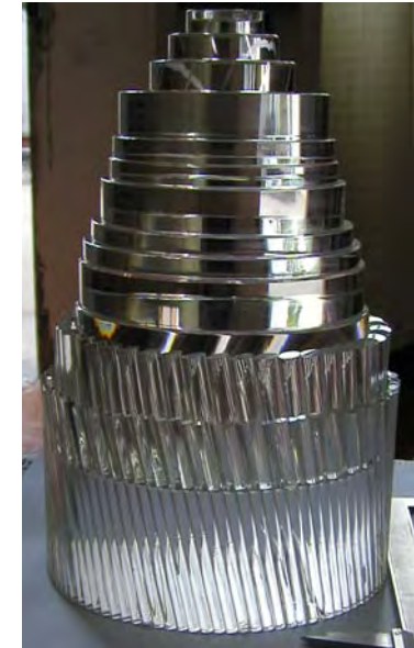
Its bright, it's shiny - it's a Solid Crystal Model from Idrawfast. Can you imagine your building looking just like this? Call us today.